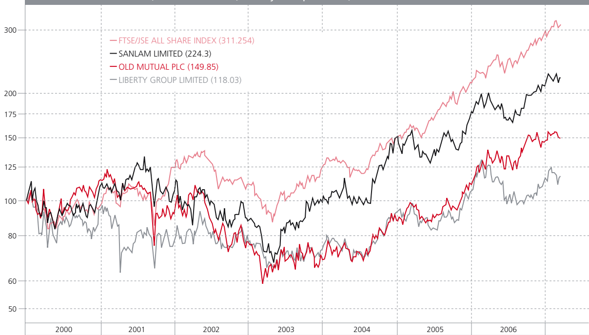
GRAPH 1 Sanlam Limited, Old Mutual PLC , Liberty Group Limited, all based to 100 at the start