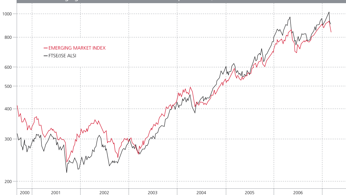
GRAPH 2 Emerging Market Index vs FTSE/JSE ALSI expressed in $